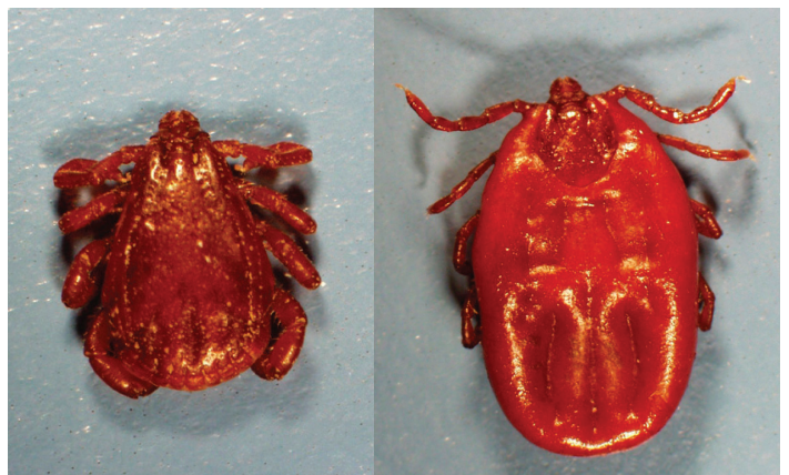
Figure 6. Adult brown dog tick ( Rhipicephalus sanguineus ) male (L) and female (R).

It is the only species of tick that infests human dwellings and kennels in North America and the entire life cycle can be completed indoors. Infestations can occur in heated buildings any time of the year. These ticks often crawl into the ceilings and into cracks and crevices along floors to molt or lay eggs. Infestations of homes or kennels are distressing to pet owners and are extremely difficult to eradicate. Infestations in kennels may be associated with outbreaks of Ehrlichia canis (canine ehrlichiosis) and Babesia canis .