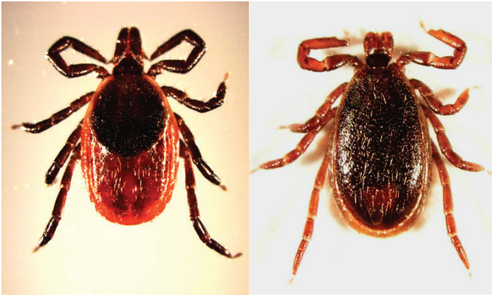
Figure 7. Adult Black-legged tick ( Ixodes scapularis ) male (L) and female (R).