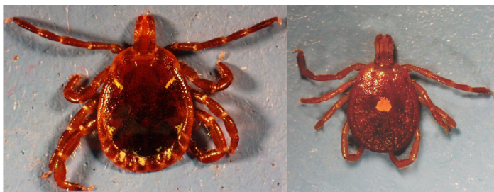
Figure 3. Adult lone star tick ( Amblyomma americanum ) male (L) and female (R).

While the lone star tick is considered a major nuisance parasite, it is also a vector of Ehrlichia chaffeensis (human monocytic ehrlichiosis) and Borrelia lonestari , which causes a Lyme disease-like infection called southern tick-associated rash illness. This tick has also been implicated in the transmission of Francisella tularensis (tularemia), Heartland virus, and Bourbon virus. Bourbon virus was discovered in Bourbon County, Kansas in 2014. This tick is also commonly associated with alpha-gal syndrome, known as the red meat allergy.