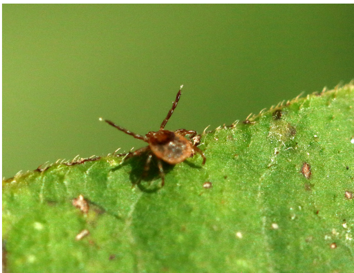
Figure 1. Adult tick showing questing behavior.

The tick species that most commonly infest people and domestic animals in Kansas are Amblyomma americanum (lone star tick), Dermacentor variabilis (American dog tick), Dermacentor albipictus (winter tick), Ixodes scapularis (blacklegged tick or deer tick) and Rhipicephalus sanguineus (brown dog tick).