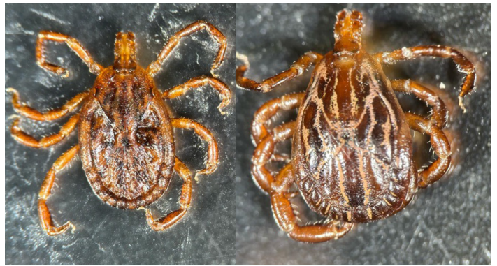
Figure 5. Adult Gulf Coast tick ( Amblyomma maculatum ) male (L) and female (R).

Although not as common, the closely related Gulf Coast tick, Amblyomma maculatum (Figure 5) can be found feeding on the ears of cattle causing an inward turning and scarring called gotch ear. It is also a vector for Hepatozoon americanum , the etiologic agent of American canine hepatozoonosis. The transmission of this pathogen is unclear, but it is thought dogs need to ingest the tick to become infected.