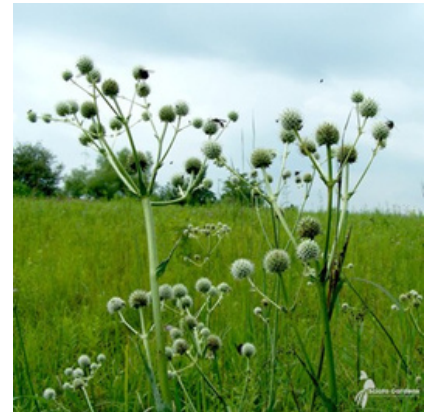
Rattlesnake master is a favorite among the 2,000 Kansas native plant species!

Rattlesnake Master Eryngium yuccafolium is a common forb (broad-leaved plant) of the tall grass prairie ecosystem. Indigenous people used it as an antidote for rattlesnake bites and wove baskets from the fibrous leaves. Despite the lack of flashy flowers, gardeners love its architectural appearance with flower stems 3 to 4 feet tall topped by globular umbels. Although in the carrot family, it is not a Black Swallowtail host plant. And butterflies are not attracted to the flowers; however, native bees, wasps and flies eagerly forage for the pollen.