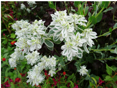
Snow-on-the Mountain is a spectacular long-blooming native annual, extremely drought-tolerant!

Snow on the Mountain Euphorbia Marginata is actually an annual but it vigorously self-seeds to reappear every year. (Even I must admit that it is invasive, but that's a virtue in my garden.) Like Poinsettias, a fellow member of the Euphorbia family, the flowers are minute and nondescript; however, the colorful "petals" are actually bracts, which remain attractive for months. In my prairie, it grows to 18" but in my well-watered garden it achieves a height of 4 feet. Stunning!