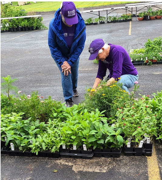
We are our own best customers in order to help other customers

Please plan to sign up! There will be approximately 7,000 plants and hundreds of shoppers. Your help is needed. Plus, it's really fun!