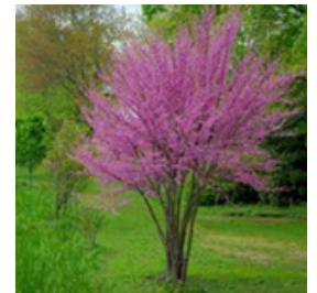
Redbuds are an outstanding landscape tree with few pests or problems.