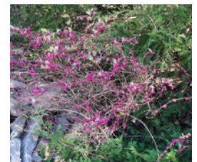
Indian Current berries are brilliant until February when they turn brown. They are not edible, even by birds.