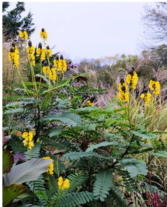
Here's my Popcorn Senna, 6' tall by August. They are in Group 6, the butterfly hosts, because Sulphur Butterflies caterpillars eat the leaves. We butterfly gardeners want to see nibbled holes on our plants!