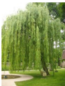
A Weeping Willow makes an elegant if messy statement in your landscape!

Indian current Symphocarpus orbitulatus , also known as Buckbrush or Coralberry, is a native shrub in the honeysuckle family with brilliant deep pink berries. It grows in partial shade in bottom woodlands and often forms dense thickets because it spreads by long surface roots that the Indians used for weaving baskets. It grows naturally on Betsy's wooded, creek property and assists with erosion control on creek banks and slopes. Tiny white flowers attract bees, and reddish-purple berries provide winter interest. Unfortunately, it is an aggressive spreader so choose its site carefully. A redeeming virtue, it is a host plant for one of the world's cutest moths, the Clear-wing Bumble Bee Moth. (See photo, right bottom.)