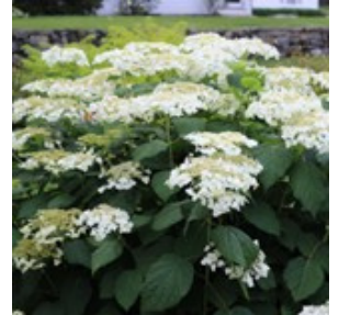
Hydrangea 'Haas Halo' was a naturally occurring variety of our native Hydrangea arborescens that has now become a best seller at nurseries.

Weeping Willow , Salix babylonica . Amy celebrates that spring has finally arrived when she sees the bright chartreuse leaves on her Weeping Willow. This popular ornamental tree has pendulous branches and flourishes in moist sunny sites. It grows rapidly to an impressive specimen up to 80 feet tall, but even its fans admit that it is messy and short-lived. These are minor flaws for such beauty. And it is a host for Viceroy and Red-spotted Purple butterfly caterpillars.