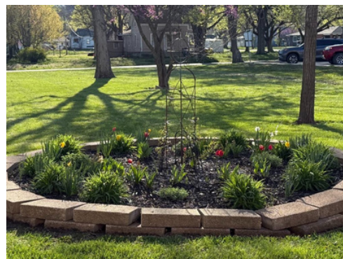
The 'circle' garden at the LinCo. Courthouse Garden

It's April and things are ramping up... Clean-up has already taken place at the MiCo Courthouse Garden... A couple of short-term projects have been completed.... In a couple of weeks, it's the annual plant sale... The work at the LinCo Courthouse Garden has already started... The Trial Garden and Cutting Garden will start clean-up (and hopefully planting) in May.