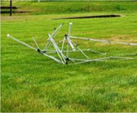
In 2022 the wind threw one tent across Pearl Street and the other was found at the Paola Country Club!