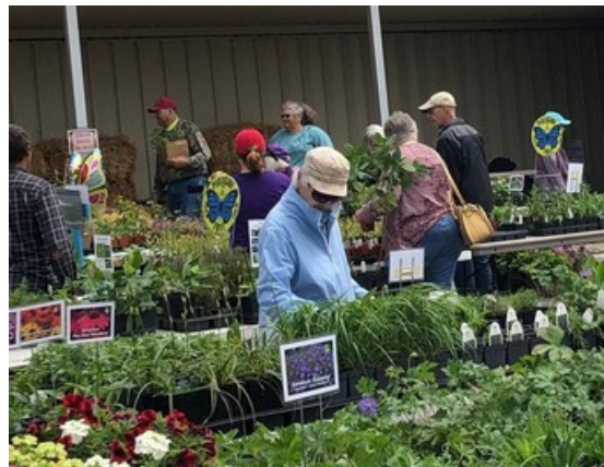
2023 Plant Sale at the Extension parking lot

Most of our EMGs LOVE, LOVE staffing the Plant Sale as an opportunity to talk about plants, assist customers and buy lots of plants for themselves. In December, we'll begin recruiting "Plant Ambassadors" (PA's) to specialize in specific plant types, our 14 "Groups". Sign-up Genius will be opened in March with specific hours and tasks (like Cashier, etc.). Please plan to join us!