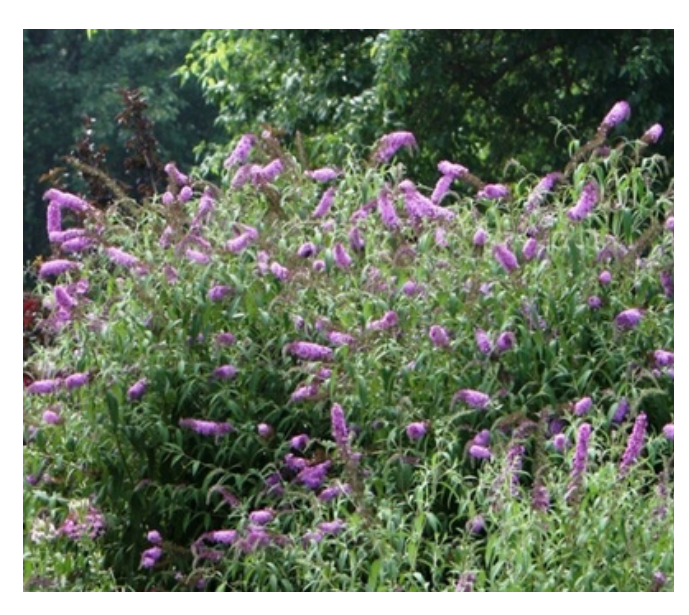
How do you pronounce the genus of Butterfly Bush, Buddleia ? Buhd' -lee-uh is preferred but I've always called it Boood '-lee-uh. I'm not ashamed.

Celebrate that you already know Clematis, a botanical name. In fact you already know many Latin names for plants' whose genus names are also used as one of its common names: Aster, Zinnia, Cosmos, Petunia, Angelonia, etc. Don't worry about pronunciation! Just Google, then practice out-loud a few times. Then say it fast with confidence. If some rude person corrects you, just say "that's how I learned to say it. But did you understand what plant I meant?" Of course, the listener did and that's what matters.